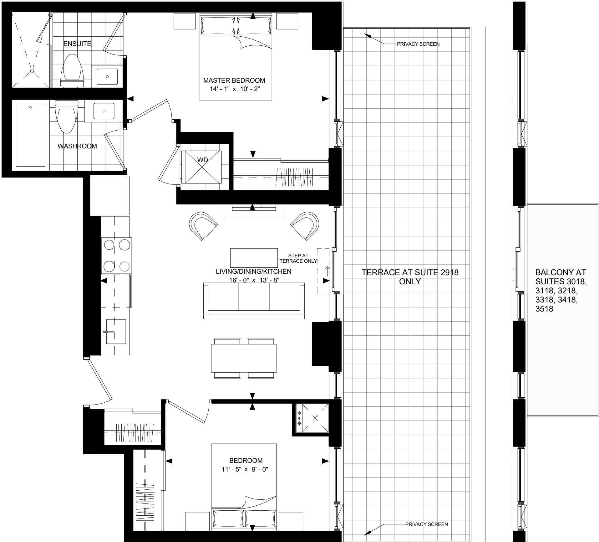
SUITE 2-F SUITE AREA: 711 sf