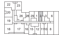
FLOOR 11 UNIT 1102 SLAB TO SLAB HEIGHT 9'6"