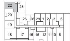
FLOOR 11 UNIT 1122 SLAB TO SLAB HEIGHT 8'6"