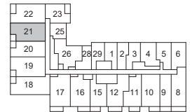
FLOOR 7 UNIT 721 SLAB TO SLAB HEIGHT 9'0"