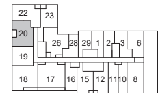
FLOOR 11 UNIT 1120 SLAB TO SLAB HEIGHT 8'6"